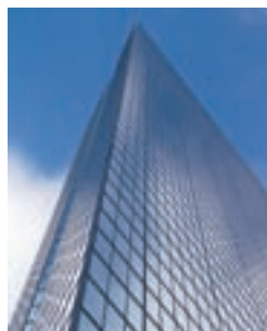
HVAC / Building management